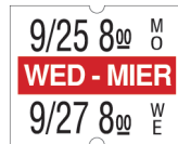
Actual Size of Label